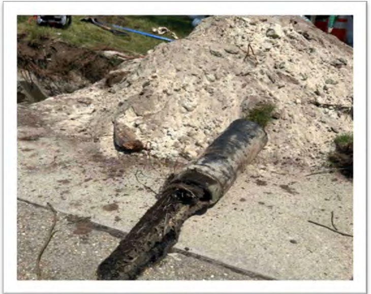
Pictured Above: Heavy root intrusion in a sewer lateral pipe. The roots completely took over the sewer lateral and caused extensive damage.

Upon arrival the goal for the technician is to clear the backup. They will restore flow to your system and diagnose the cause of the backup. All technicians are trained and certified to diagnose the cause of the backup using the American Society for Testing Materials (ASTM) & Pipeline Assessment Certification Program (PACP) standards. This process includes flow testing and camera inspections using CCTV inspection equipment.